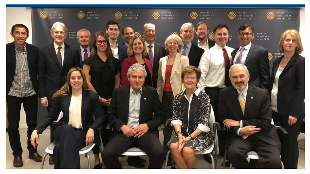
WRI Board and Staff with members of WRI's Global Leadership Council at the WRI Fall Global Board Meeting in Washington, DC.